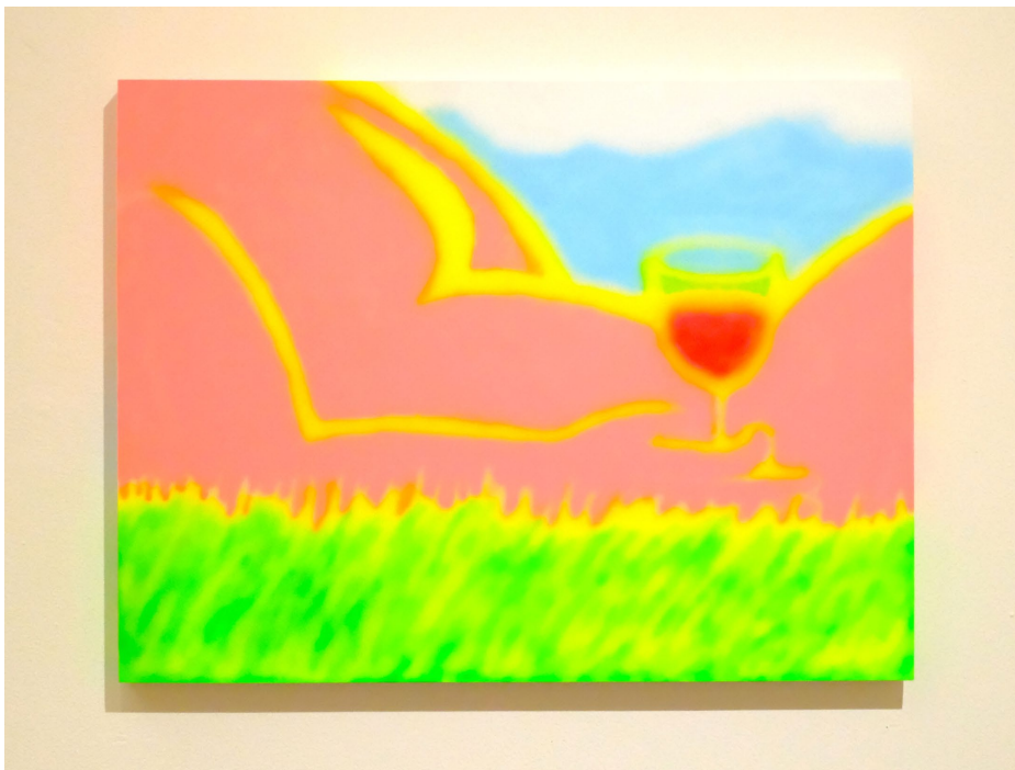
A windy hill 2023 Acrylic on panel 20×18"