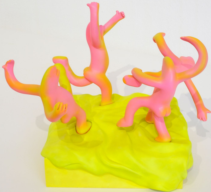
Dancing pink 2023 Mixed media 7×6×6"