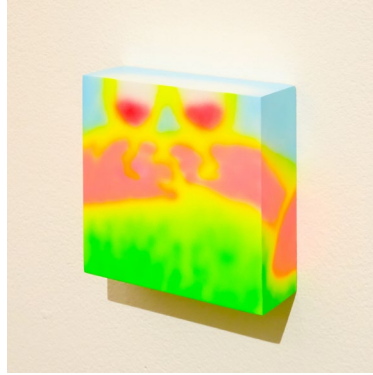
The heartstrings 2023 Acrylic on panel 4×4"