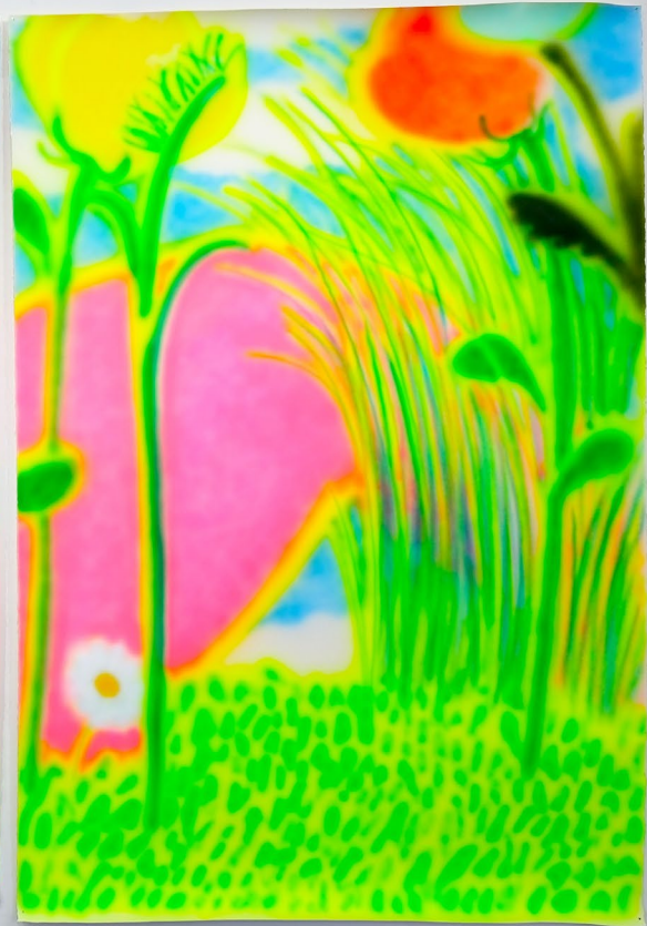
Spring 1,2 2024 Acrylic on paper 51×71" each