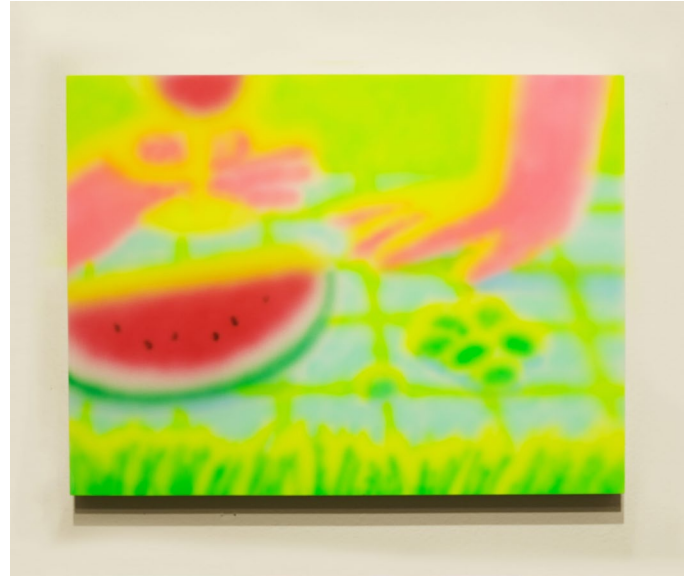
The luncheon on the grass 2023 Acrylic on panel 16×12"