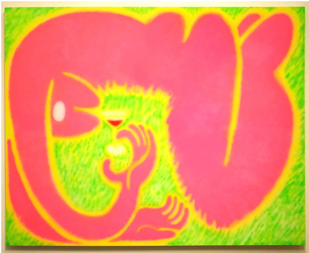
Freedom in the square field 2023 Acrylic on panel 60×48"