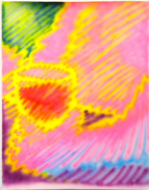
Reflection 2024 Acrylic on paper 50×65"