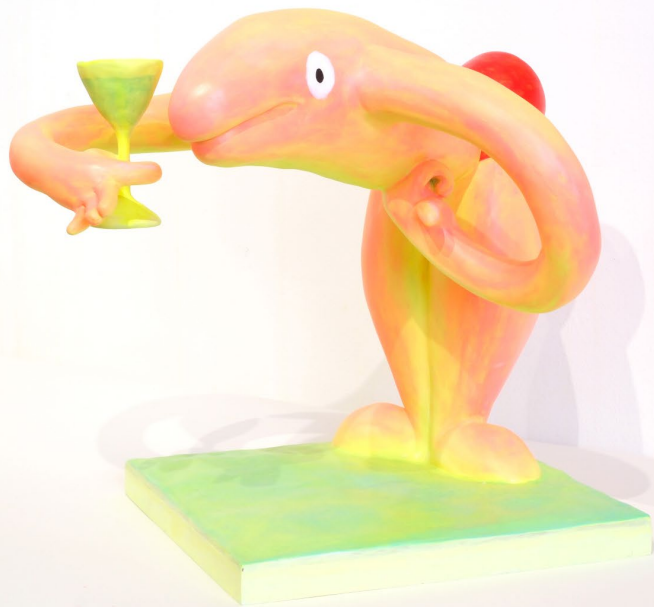
Love dive 2023 Mixed media 16.5×15×15"