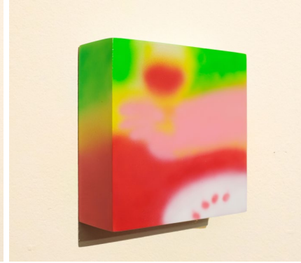
Red meal 2023 Acrylic on panel 4×4"