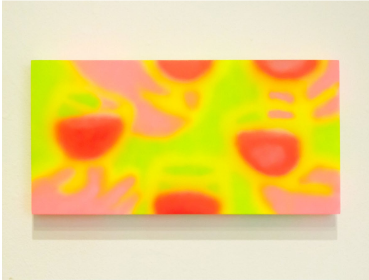
Clink 2023 Acrylic on panel 12×6"