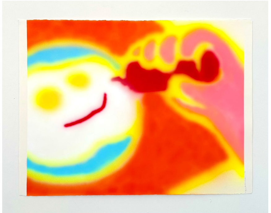
Smiley breakfast 2023 Acrylic on paper 30×22.5"